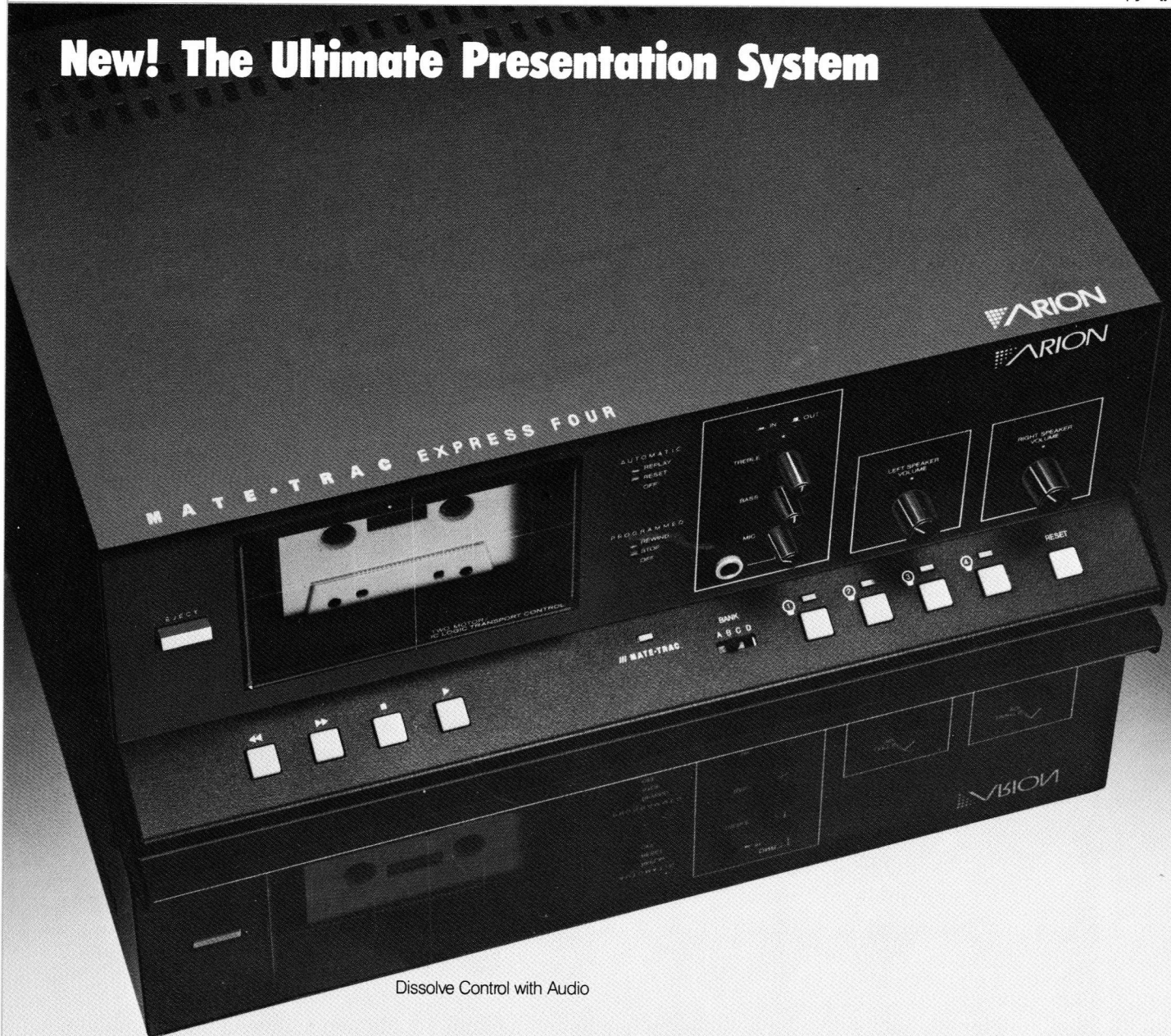
Dissolve Control with Audio

The new EXPRESS FOUR is the only portable four projector presentation system with integrated, professional quality stereo sound. In a single package, advanced audio components come together with the world's most reliable dissolve control to form a striking example of creative, innovative industrial design. Powerful micro electronics provide flawless control for your 1,2,3, even 4 projector shows. Built-in stereo provides you with pure sound clarity comparable to that of professional sound studios.